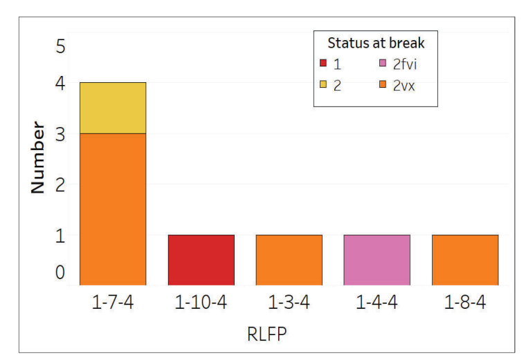
Figure 1 (Above). Number of PRRSV RFLP by pattern reported in MSHMP since July. Colors represent the status at break of the breeding herd.

Eight out of the 20 breaks reported were accompanied by the associated RFLP. The predominant (4 out of 8) RFLP pattern since July is 1-7-4. Iowa was the state with the highest number of 1-7-4 cases.